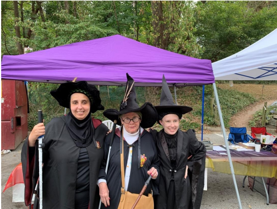
Image: Participants dressed in costume for the NFB Meet the Blind Month Wizinging Weekend on Main in Old Ellicott City